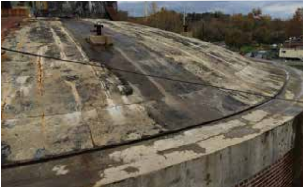
Before - Existing tank dome replacement